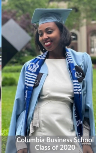
Columbia Business School Class of 2020