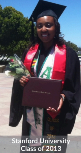
Stanford University Class of 2013