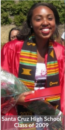
Santa Cruz High School Class of 2009

The Santa Cruz County Scholarship Endowment fund exists to benefit students of our region forever. It provides you, your business, family, or friends the option to support the higher education costs facing local students, without needing to administer a small scholarship fund or foundation on your own.