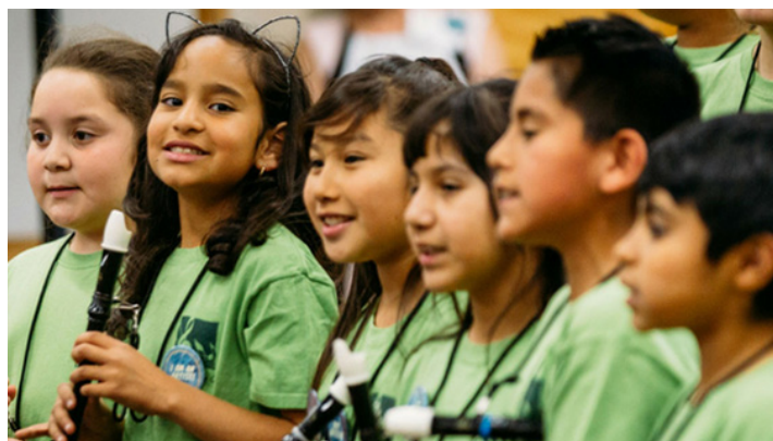
Students of arts grantee-partner El Sistema

Donors are invited to co-invest in our Community Investment Revolving Loan Fund to put local capital at work for local solutions.