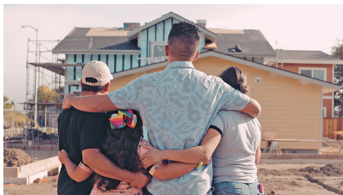
New Habitat homeowners in Live Oak

Our Community Investment Revolving Fund provides local low interest loans to the tune of $3.2 million to six local projects. These funds are already at work creating housing, growing income, and expanding sustainable agriculture. For example, Homeless Services Center is building 6 apartments for people transitioning out of temporary shelter.