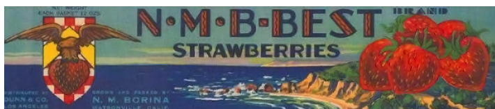
The Borina family strawberry brand label

Borina Special Places Fund supports historic, youth, and senior facilities. Because of the generosity of the Borina family, in 2019 we will award close to $400,000 for capital projects that give youth places to develop; seniors places to gather and to preserve the unique history of the county.